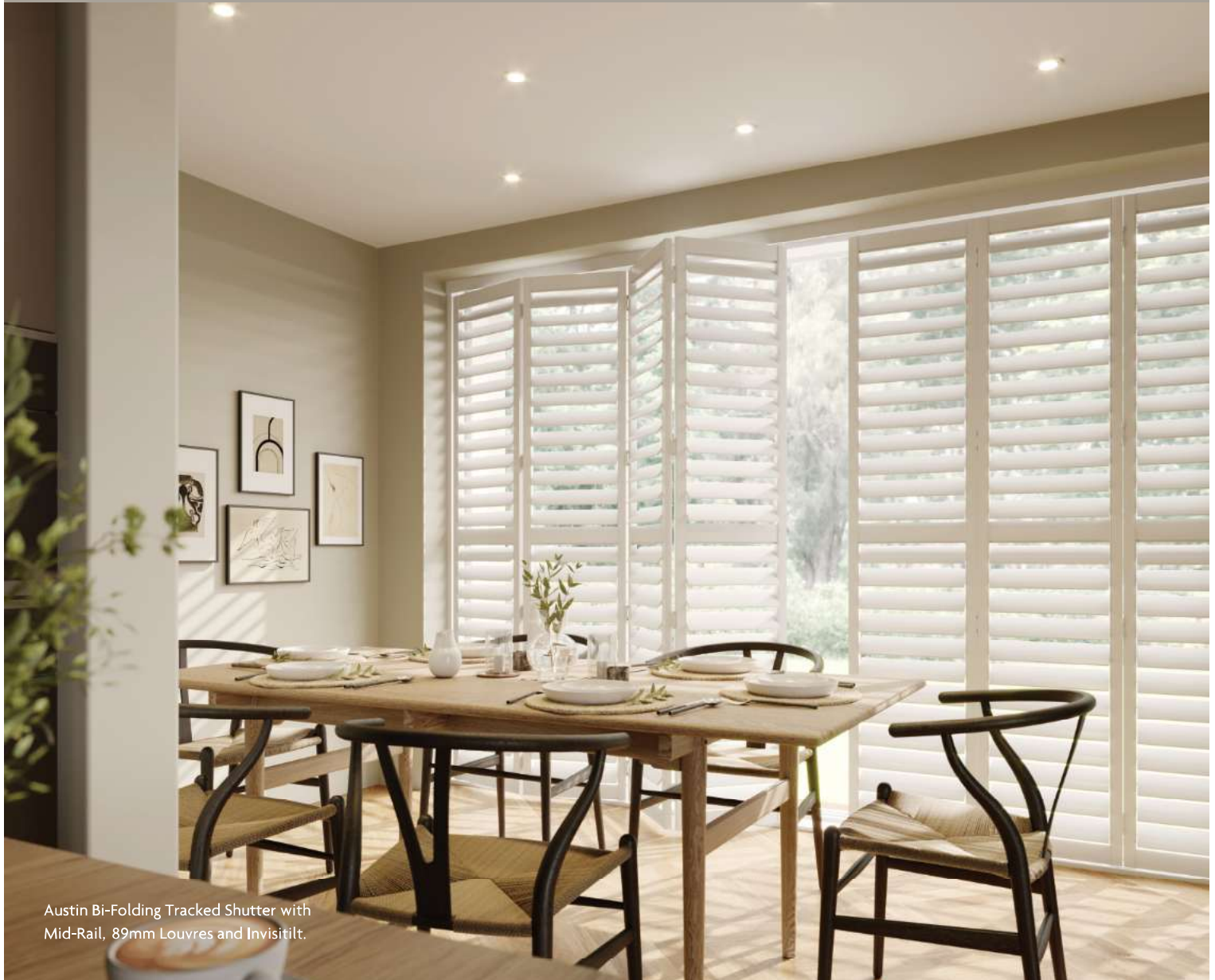
Austin Bi-Folding Tracked Shutter with Mid-Rail, 89mm Louvres and Invisitilt.

Tracked shutters can also be used as a stylish and versatile room divider.