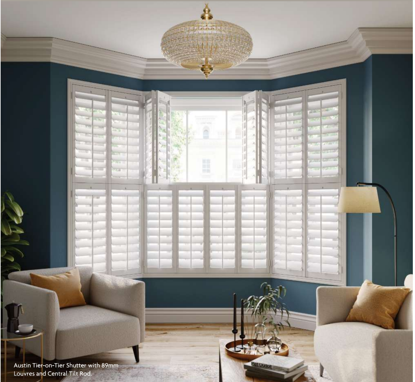
Austin Tier-on-Tier Shutter with 89mm Louvres and Central Tilt Rod.

Tier-on-Tier shutters cover the whole of the window but feature top and bottom panels which open independently of each other. These popular shutters enable versatile control of light and privacy in the daily use of your shutters.