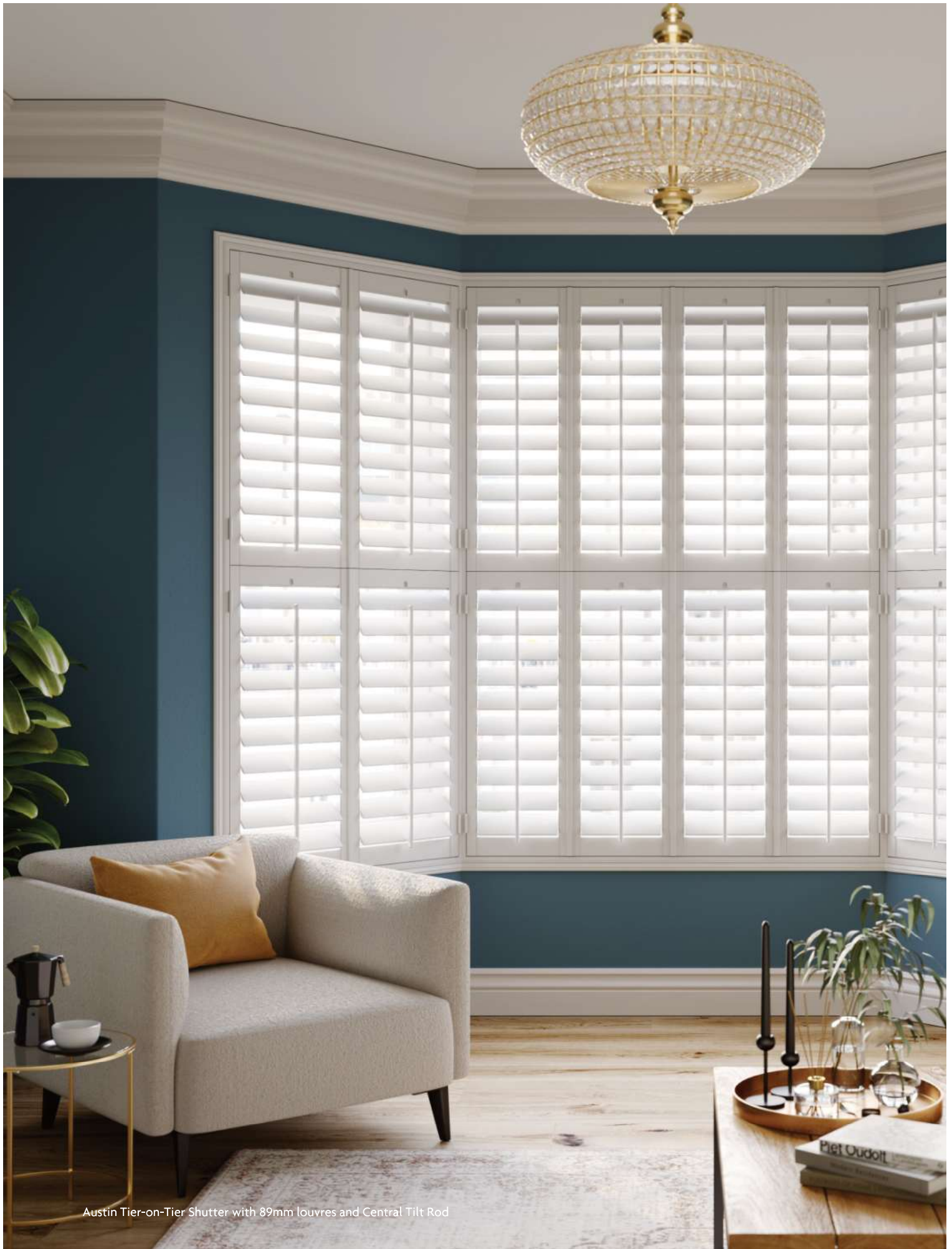
Austin Tier-on-Tier Shutter with 89mm louvres and Central Tilt Rod