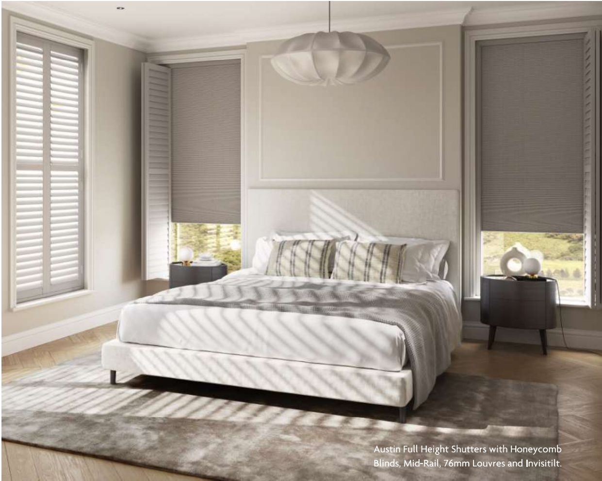
Austin Full Height Shutters with Honeycomb Blinds, Mid-Rail, 76mm Louvres and Invisitilt.