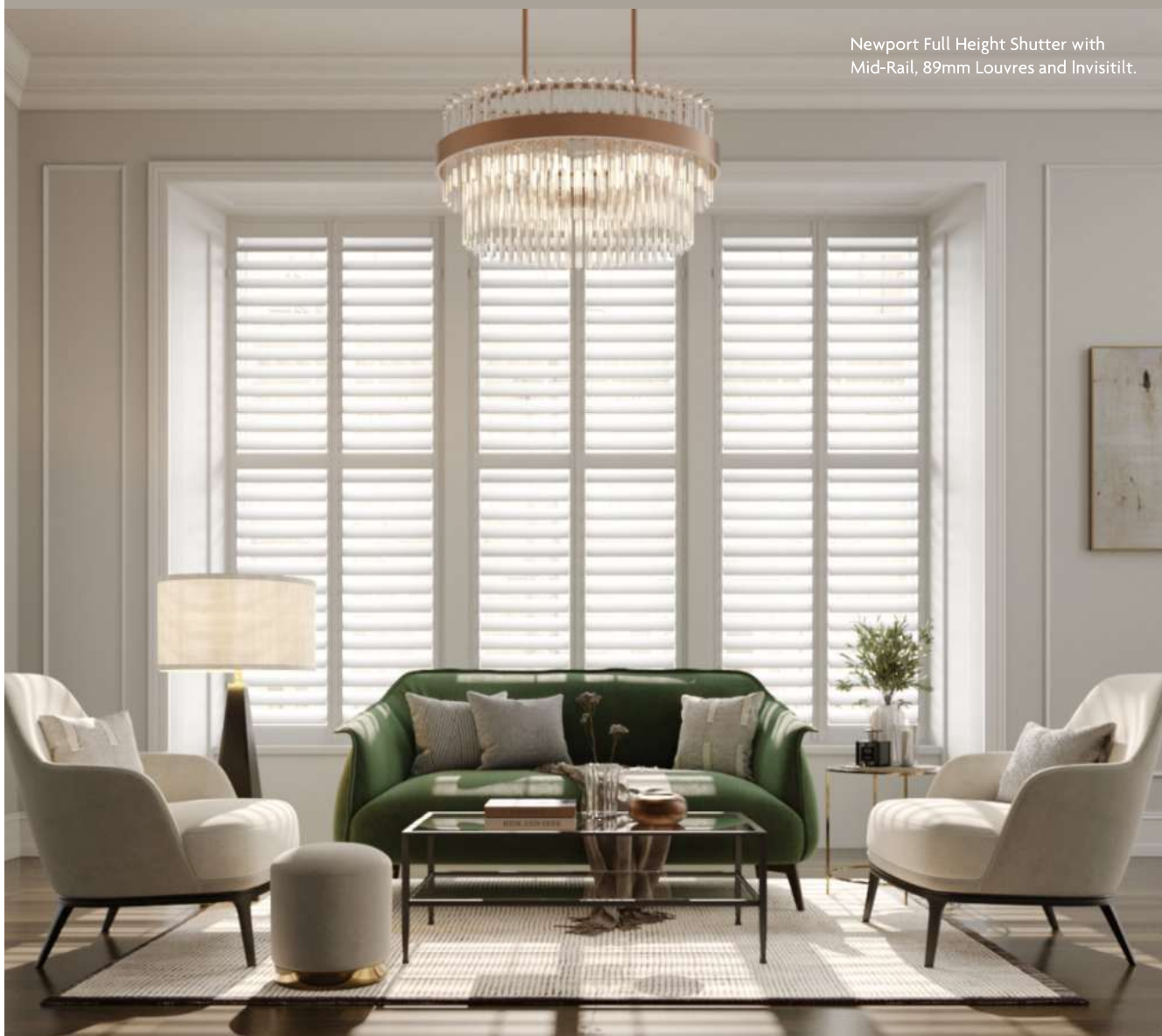
Newport Full Height Shutter with Mid-Rail, 89mm Louvres and Invisi tilt.

Newport is available in a wide range of paint colours, including custom colours.