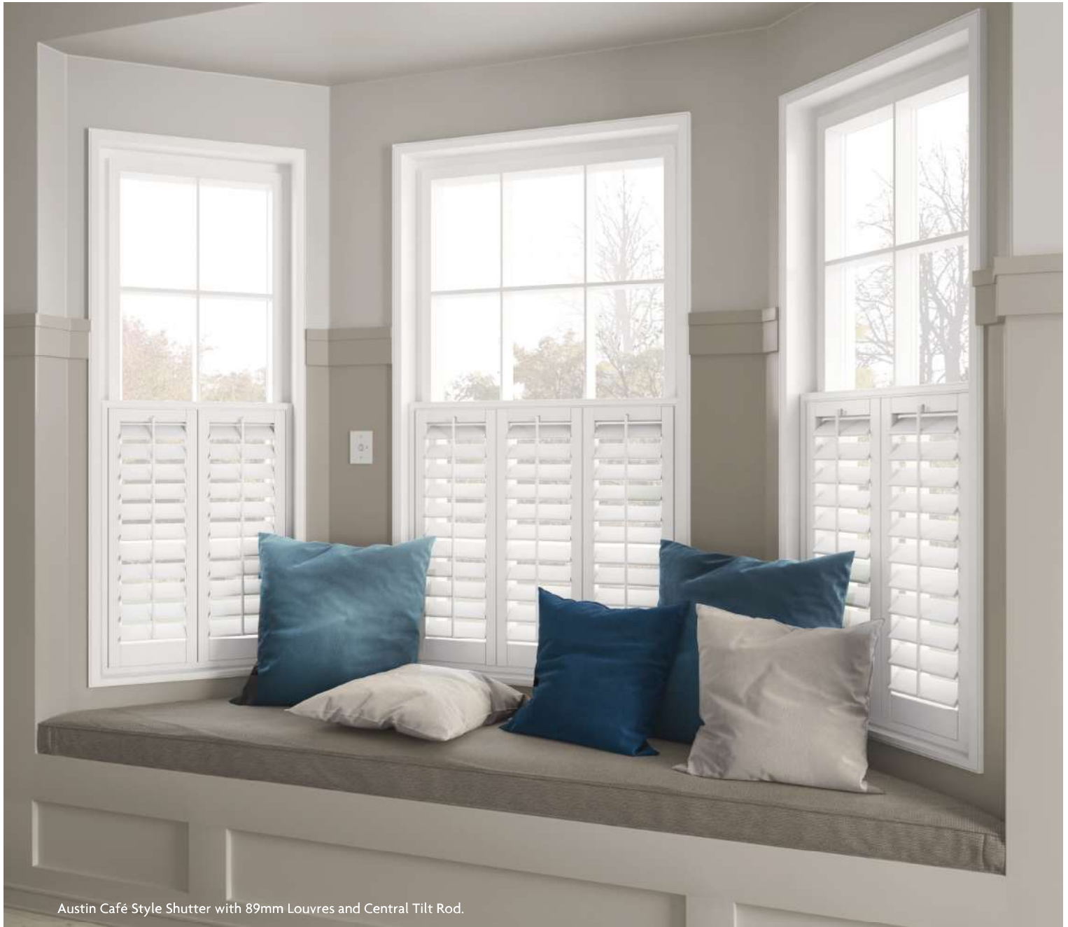
Austin Café Style Shutter with 89mm Louvres and Central Tilt Rod.