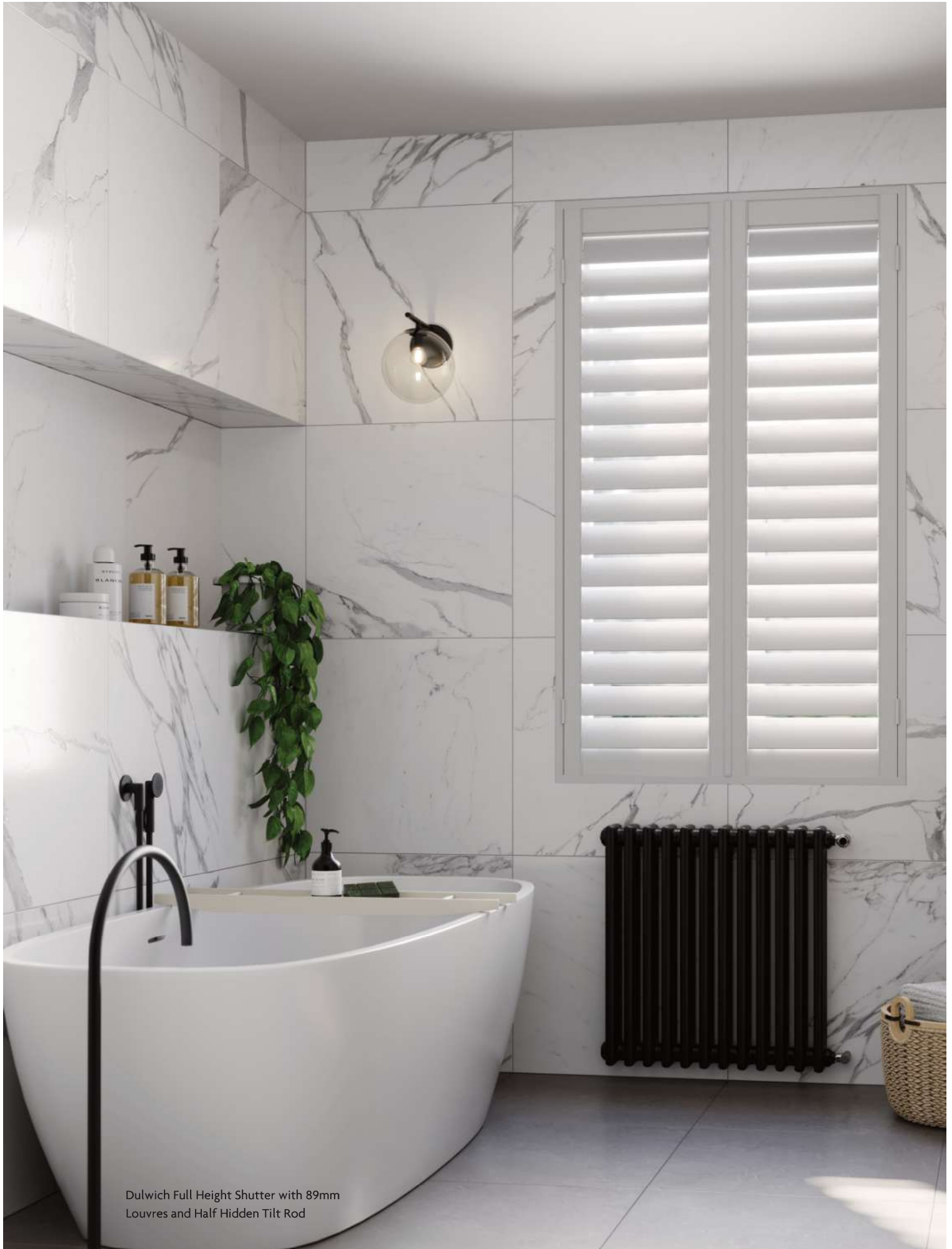
Dulwich Full Height Shutter with 89mm Louvres and Half Hidden Tilt Rod