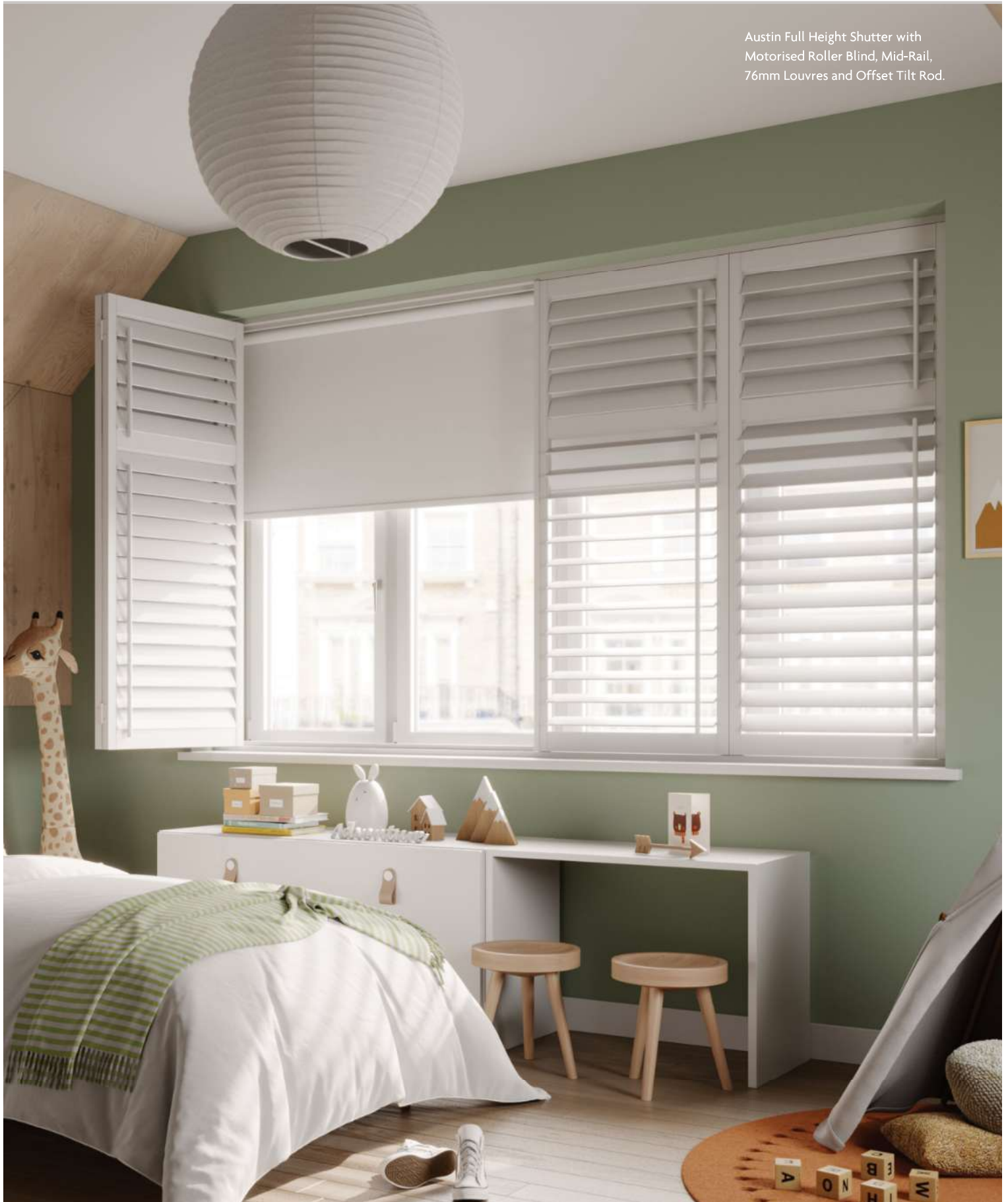
Austin Full Height Shutter with Motorised Roller Blind, Mid-Rail, 76mm Louvres and Offset Tilt Rod.