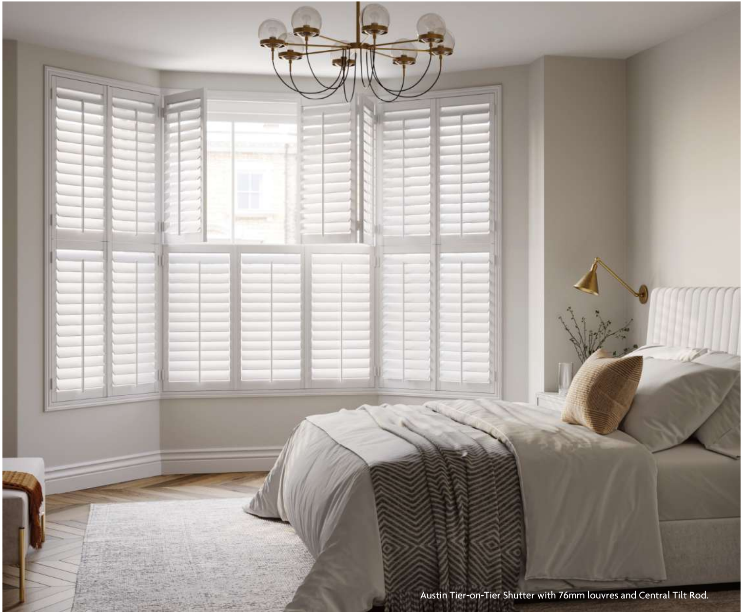
Austin Tier-on-Tier Shutter with 76mm louvres and Central Tilt Rod.