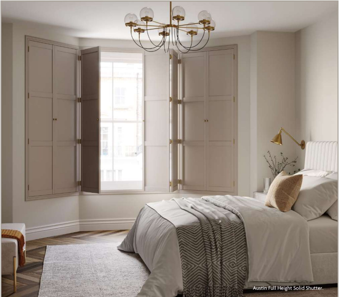
Austin Full Height Solid Shutter.