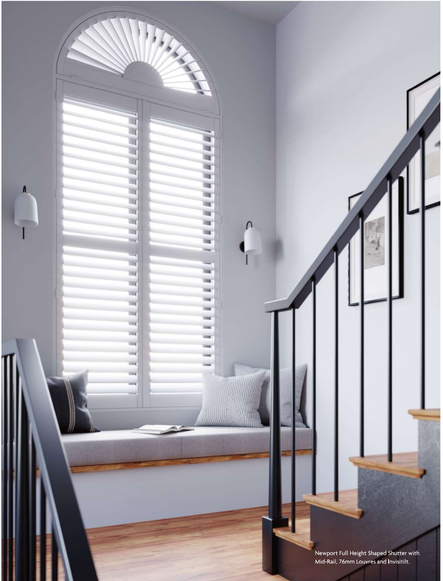
Newport Full Height Shaped Shutter with Mid-Rail, 76mm Louvres and Invisitilt.